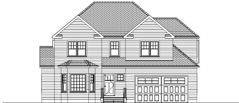
Exterior Elevation Front