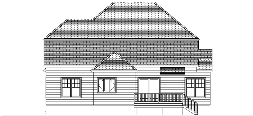
Exterior Elevation Back